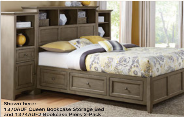
Shown here: 1370AUF Queen Bookcase Storage Bed and 1374AUF2 Bookcase Piers 2-Pack.