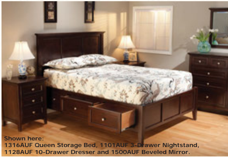
Shown here: 1316AUF Queen Storage Bed, 1101AUF 3-Drawer Nightstand, 1128AUF 10-Drawer Dresser and 1500AUF Beveled Mirror.