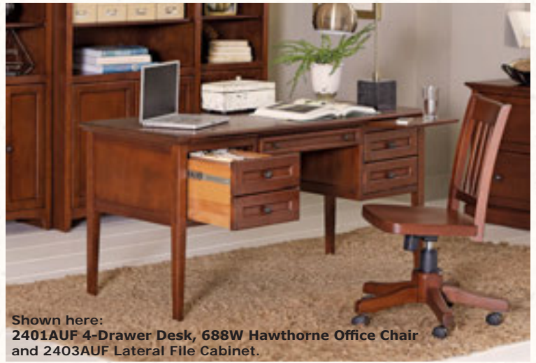
Shown here: 2401AUF 4-Drawer Desk, 688W Hawthorne Office Chair and 2403AUF Lateral File Cabinet.