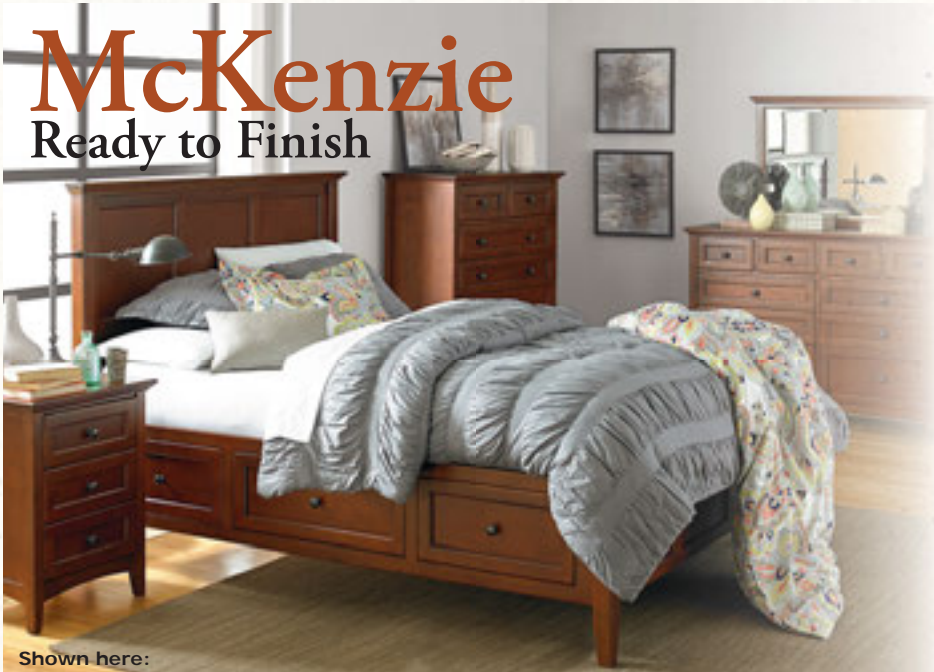
Shown here: 1316AUF Queen Storage Bed, 1101AUF 3-Drawer Nightstand, 1180AUF 6-Drawer Chest, 1128AUF 10-Drawer Dresser and 1500AUF Beveled Mirror in Fieldstone finish.

Distinctive design and elegant details make for a striking combination in this stylish bedroom collection. Made from certified sustainable American Alder and Alder veneered hardwoods, this line includes heritage-quality craftsmanship details such as English dovetail drawers, mortise and tenon joinery and fitted backs. Whisper-quiet full extension metal ball bearing drawer slides provide maximum access to spacious drawers. We're sure you will appreciate how these and other Whittier standard features enhance your family's daily lives. We look forward to helping you create your well-furnished and well-loved home.