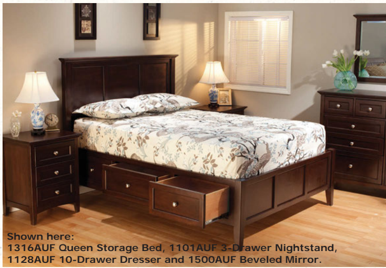
Shown here: 1316AUF Queen Storage Bed, 1101AUF 3-Drawer Nightstand, 1128AUF 10-Drawer Dresser and 1500AUF Beveled Mirror.