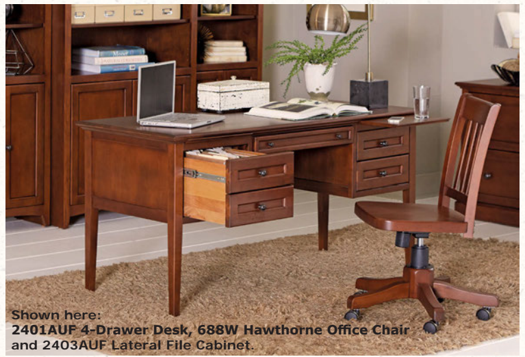
Shown here: 2401AUF 4-Drawer Desk, 688W Hawthorne Office Chair and 2403AUF Lateral File Cabinet.

One drawer features a velvet lined jewelry tray and secret storage.