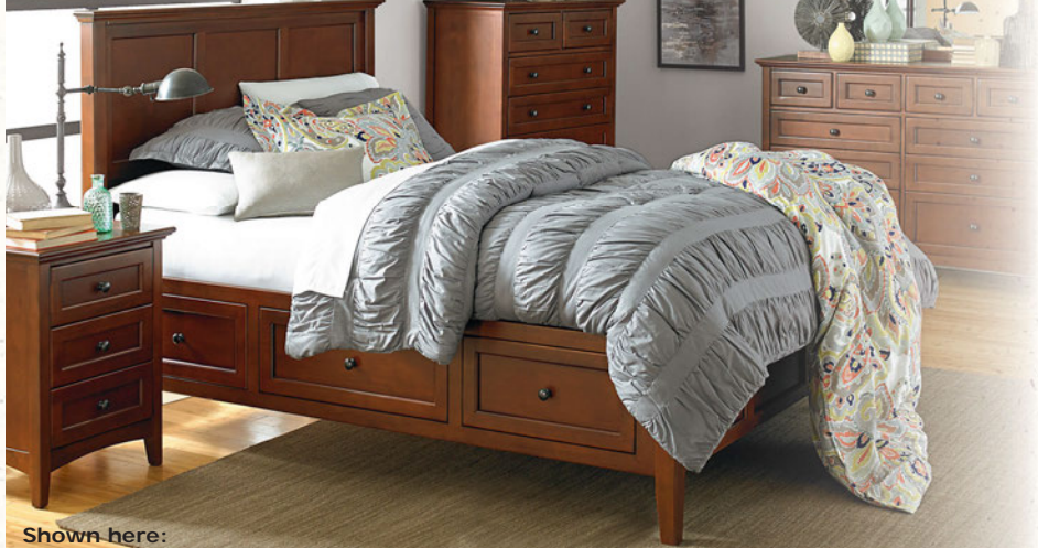
Shown here: 1316AUF Queen Storage Bed, 1101AUF 3-Drawer Nightstand, 1180AUF 6-Drawer Chest, 1128AUF 10-Drawer Dresser and 1500AUF Beveled Mirror in Fieldstone finish.

Distinctive design and elegant details make for a striking combination in this stylish bedroom collection. Made from certified sustainable American Alder and Alder veneered hardwoods, this line includes heritage-quality craftsmanship details such as English dovetail drawers, mortise and tenon joinery and fitted backs. Whisper-quiet full extension metal ball bearing drawer slides provide maximum access to spacious drawers. We're sure you will appreciate how these and other Whittier standard features enhance your family's daily lives. We look forward to helping you create your well-furnished and well-loved home.